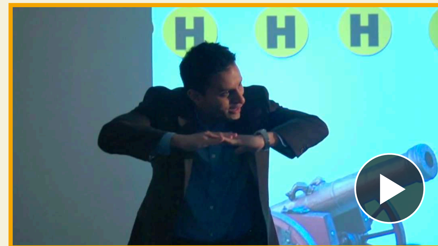
Nutrition Lecture Trailer