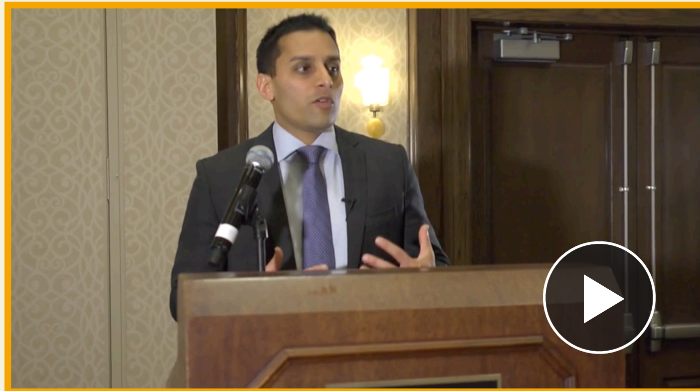
Politics of Healthcare