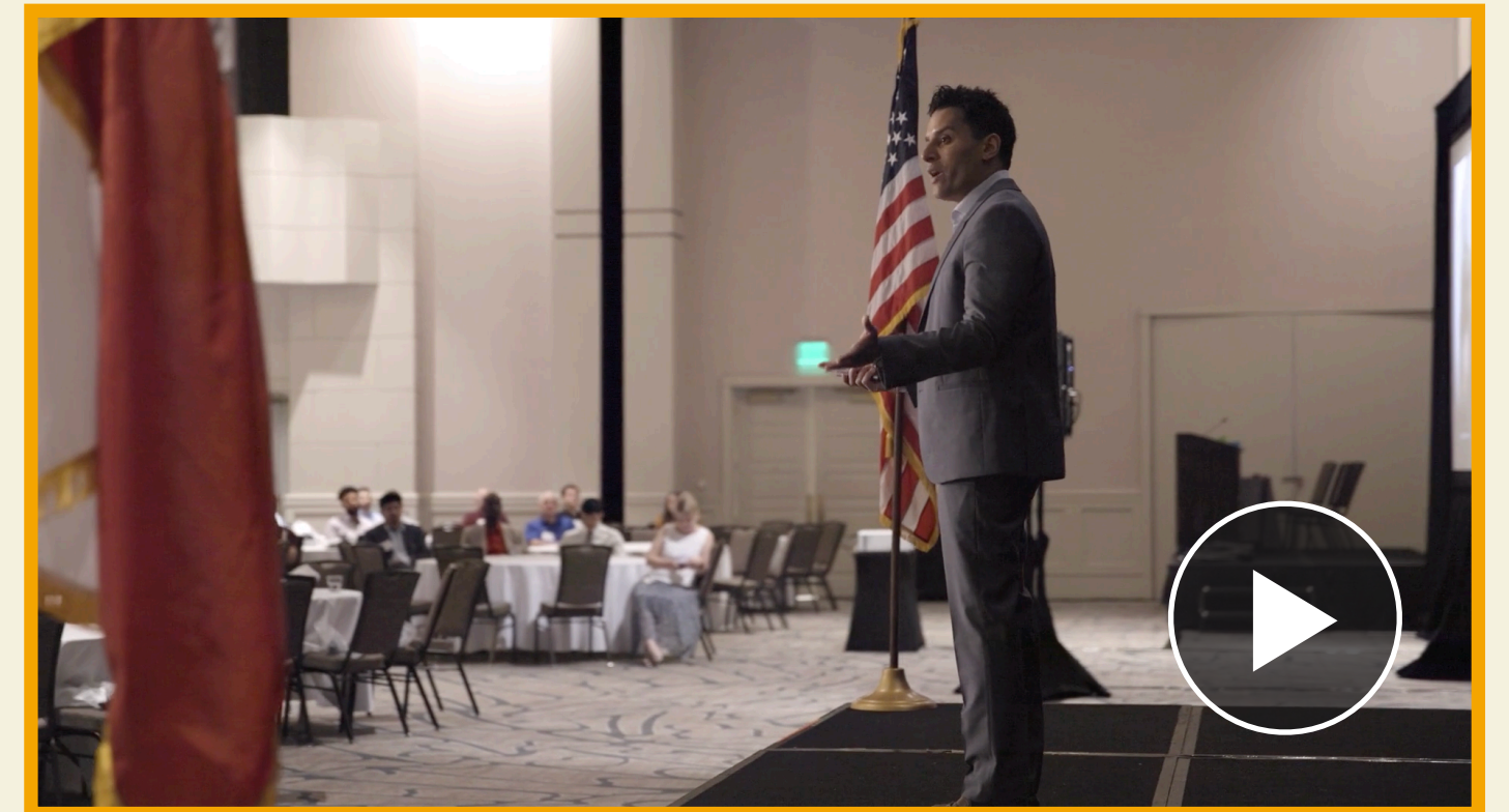
Preparing for Crisis